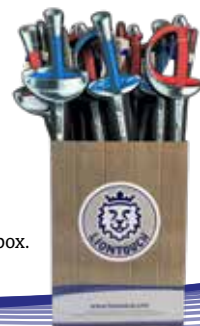
29445LT Fencing Box, Mixed. 36 pcs./ Display box.