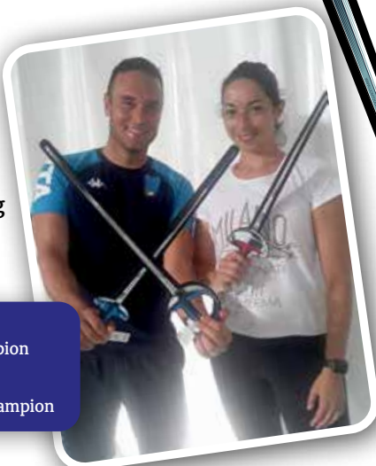
Paolo Pizzo, Italy Men's Epee World Champion

The foundation of Liontouch has always been a passion for fencing. Therefore, it's only natural that we now introduce three fencing weapons as foam toys for children. These are Epee, foil and sabre. These foam toys are designed to look exactly like the real deal, specifically aimed at the fencing community, readying the next champions.