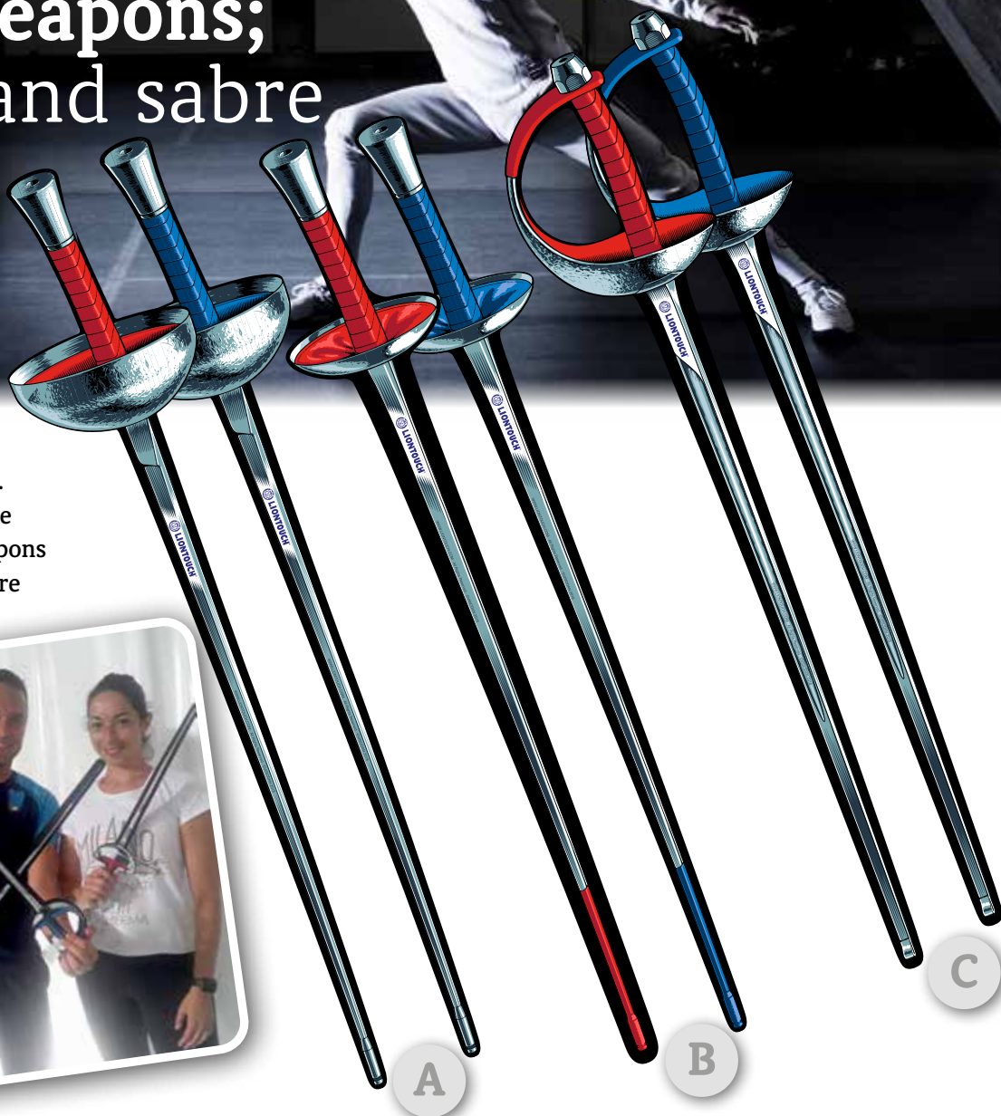
Mara Navarria, Italy Women's Epee World Champion