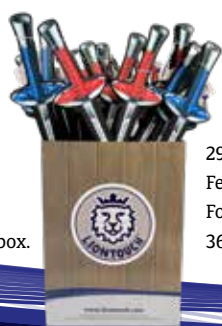
29435LT Fencing Box, Foil 36 pcs./ Display box.