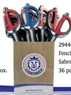
29440LT Fencing Box, Sabre 36 pcs./ Display box.